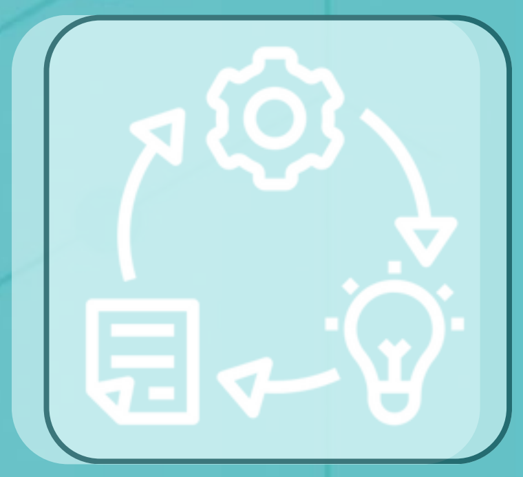
Scaling D2D Aligning innovation & standards