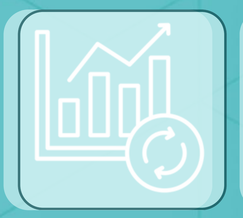
Business Models & Ecosystem Dynamics