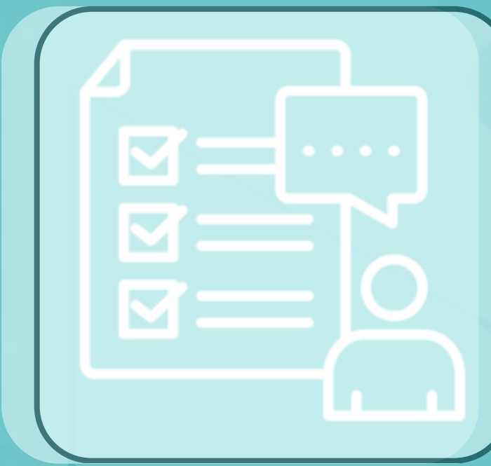
Recommendations from the recent RSPG opinion